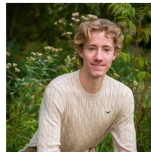
Watson Chodat Franklin Academy